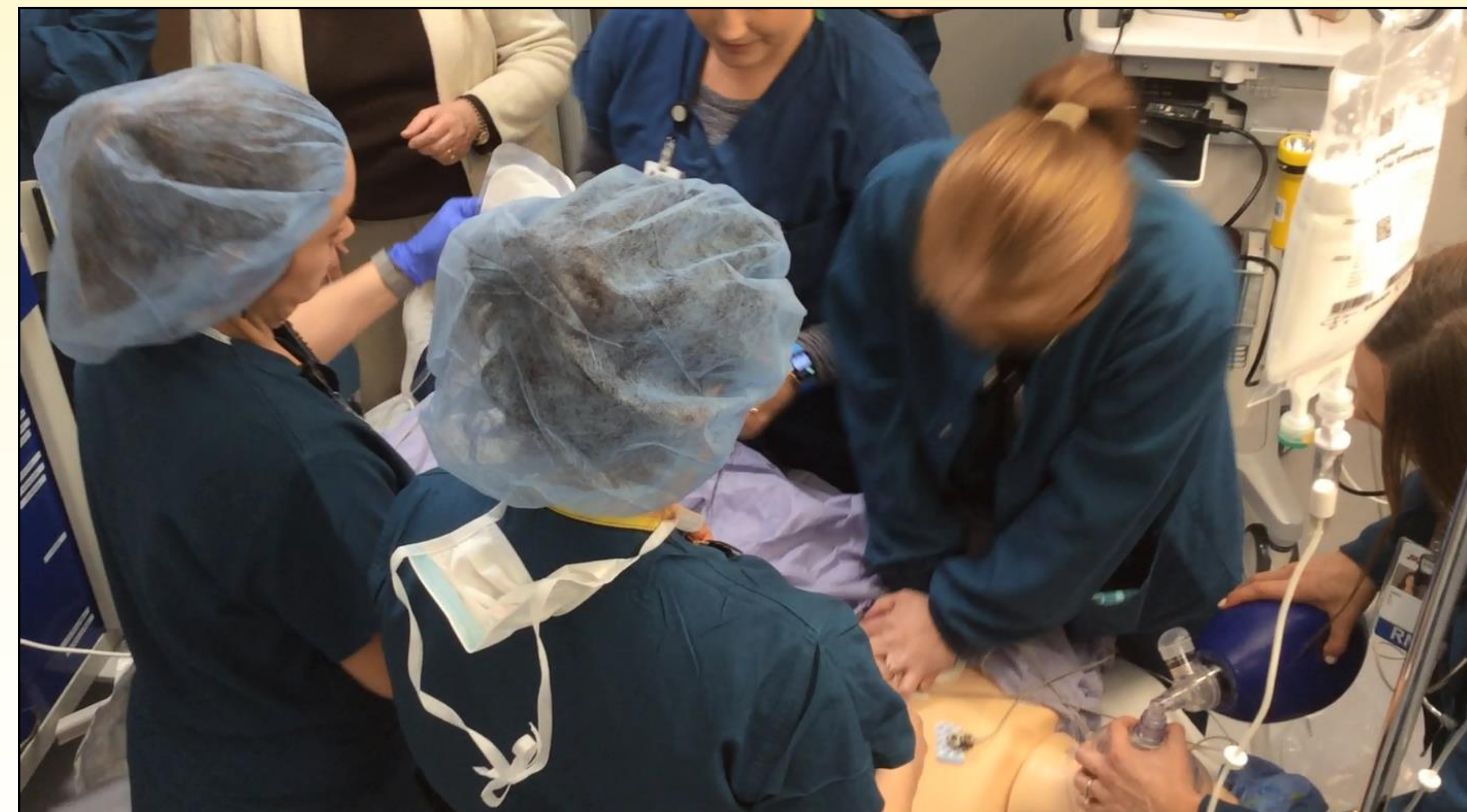
Mock Code in Action